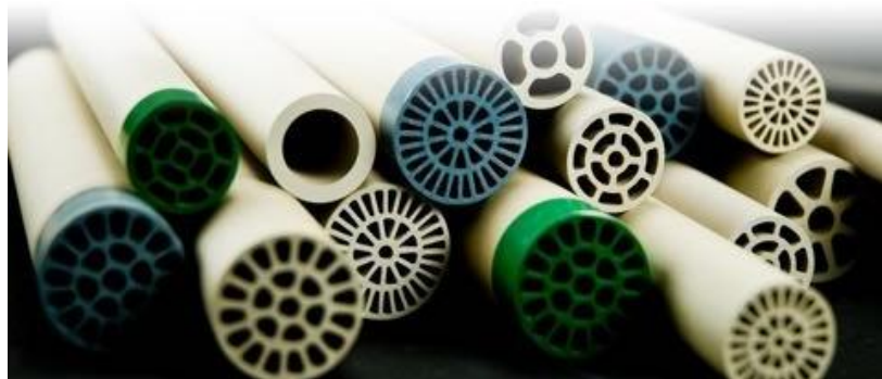
Ceramic membranes with different channel geometries produced by TAMI Industries

As a solution to this dilemma, TAMI Industries launched in the market the first industrial tubular ceramic membranes with non-circular channels in the mid 90's, after several years of R&D. Customers were skeptical due to the novelty of the solution and competitors assured that the concept was flawed. Trusting the science and strongly convinced by the efficiency of its products, TAMI Industries remained as the sole supplier of non-circular